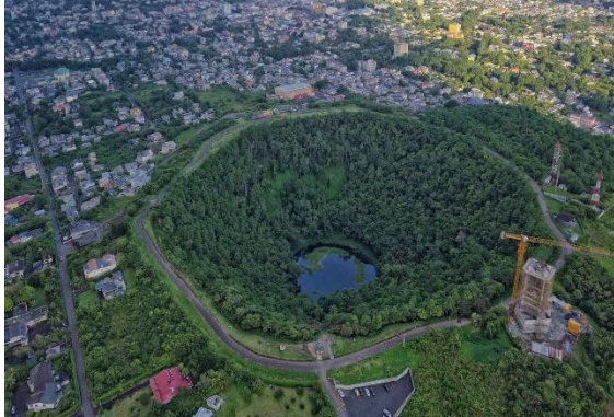
Trou aux Cerfs