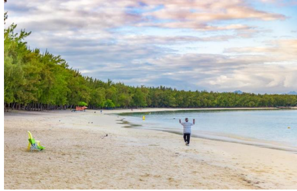
Mont Choisy Beach