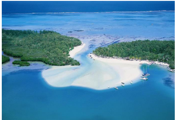
Ile Aux Cerfs Island