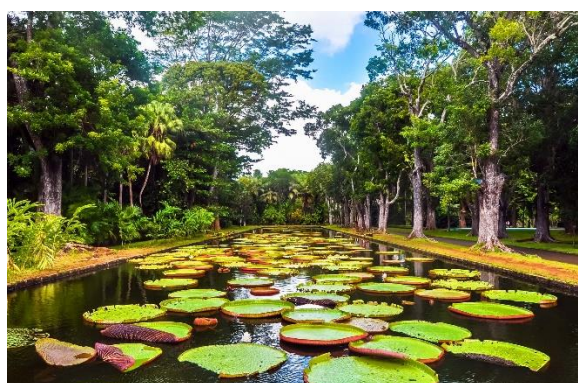
Pamplemousses Botanical Garden