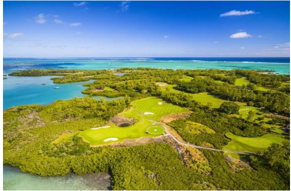
Ile aux Cerfs Island