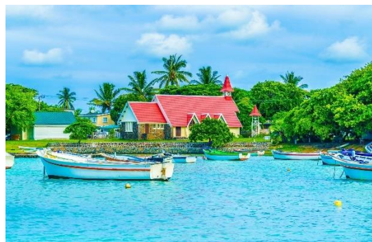
Cap Malheureux Chapel – Red Roof Church