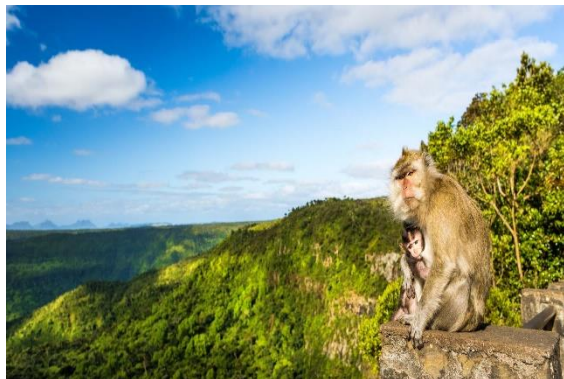
Black River Gorges National Park