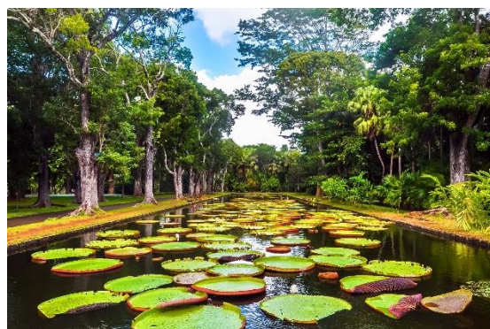
Pamplemousses Botanical Garden