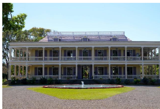
Domaine de Labourdonnais