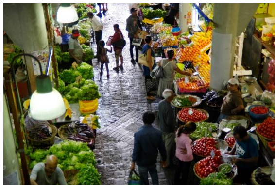
Central Market Port Louis