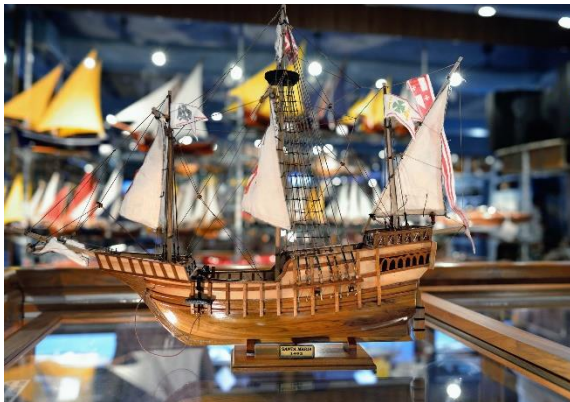
Ship Model Factory