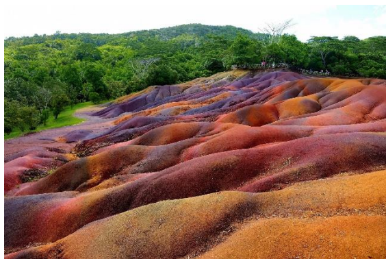
Chamarel Seven Coloured Earth